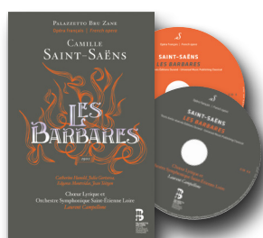
Camille Saint-Saëns Les Barbares (1901)

'French opera' series – vol. 15 BRU ZANE – 2017