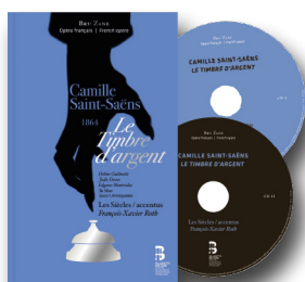
Camille Saint-Saëns Le Timbre d'argent (1864)

'French opera' series – vol. 29 BRU ZANE – 2021