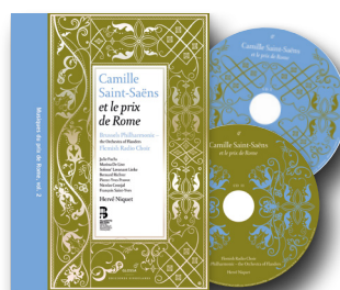
Camille Saint-Saëns et le prix de Rome

'French opera' series – vol. 8 BRU ZANE – 2014