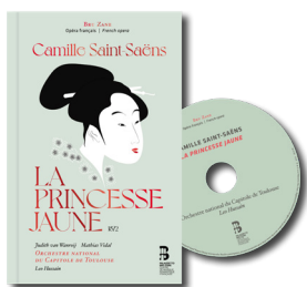
Camille Saint-Saëns La Princesse jaune (1872)